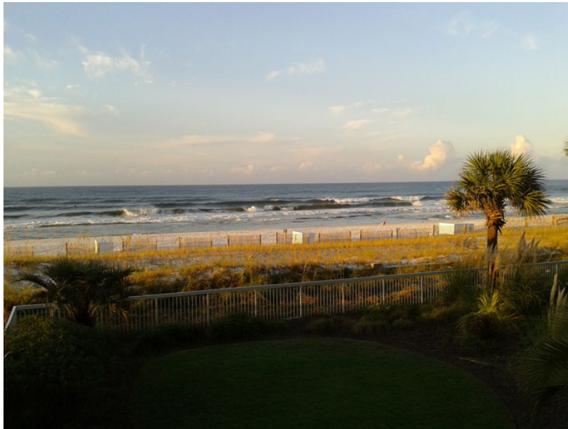
Rough surf along Fort Walton Beach on October 5 th .