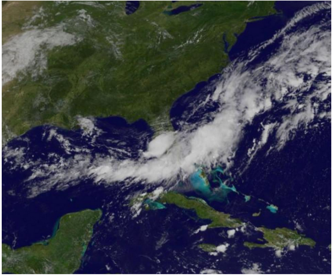
GOES visible-satellite imagery of Tropical Storm Emily.